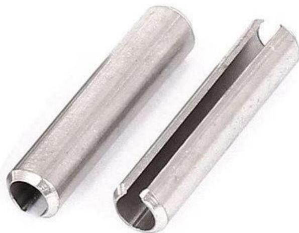
Spring Dowell pins