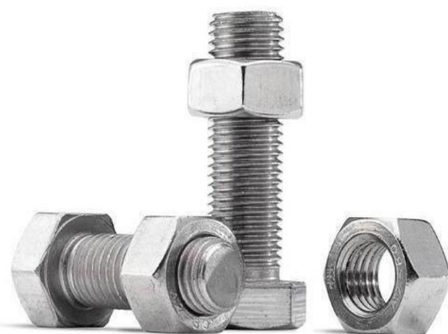
Nuts & Bolts