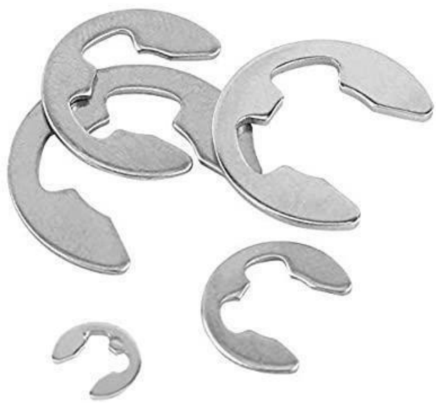
E Retaining Clips